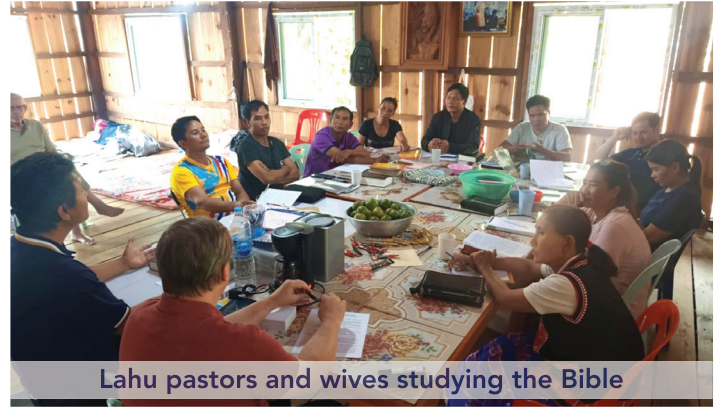
Lahu pastors and wives studying the Bible

Help is needed to print Bible lessons for the Lahu