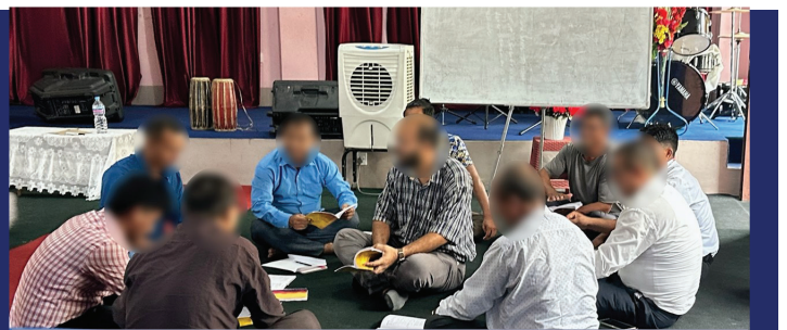
Some of the pastors at the August training in Nepal

Our Nepali pastors often minister to their people at great personal risk, yet they continue to seek the skills and training to teach the Word of God and to serve their small congregations. Many of these men are full-time farmers, and some traveled more than 10 hours by bus to be part of our recent July training. Nine new pastors joined us this summer, along with 4 women who are studying Scripture and learning how to lead women's ministries in their home churches.