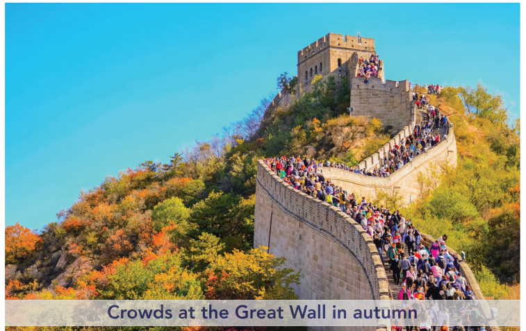
Crowds at the Great Wall in autumn

However, this was a great time of encouragement—to be able to love other brothers and sisters that have not only been going through the political strains of sanctions but also persecution for being Christians. They