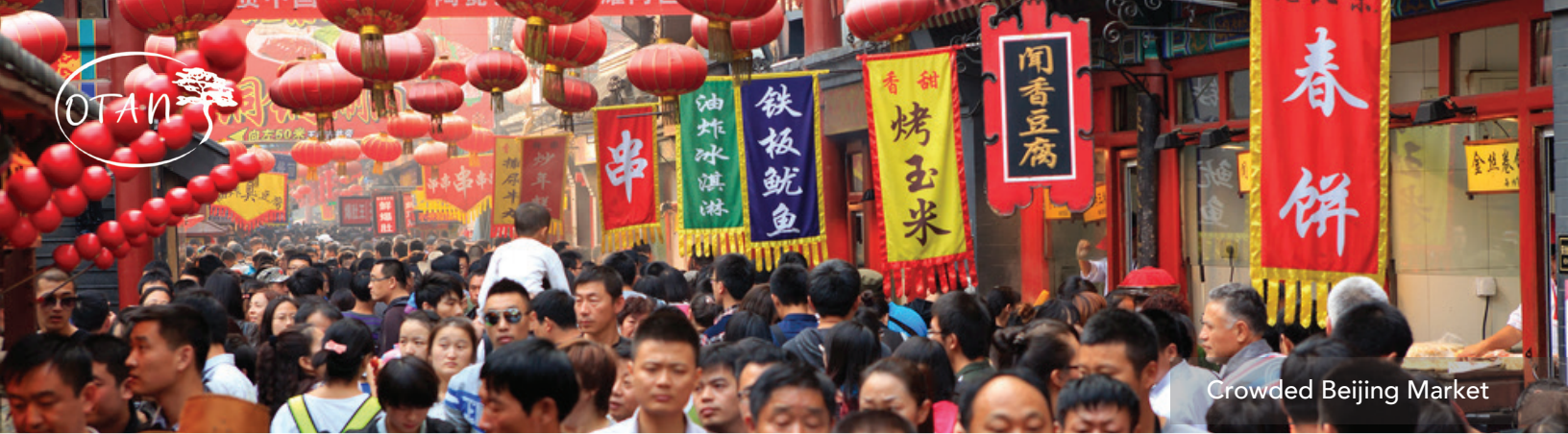
Crowded Beijing Market