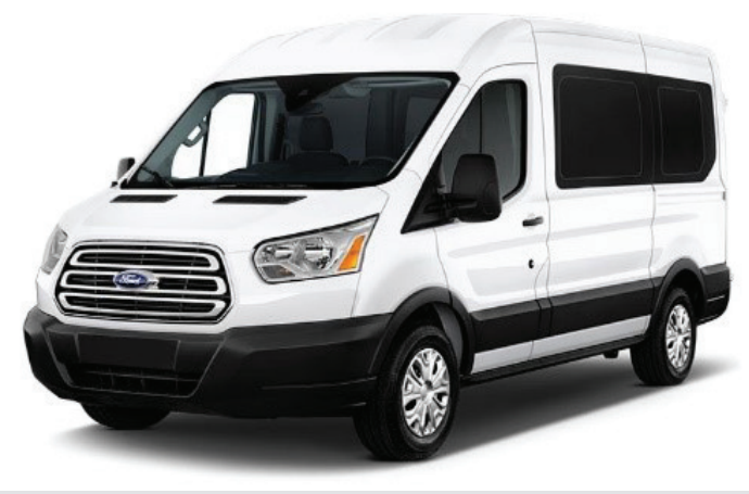
OTAN Mobile Training Center van

Our Mobile Training Center van needs to be fully funded by September 2 of this year. Can you help to provide a safe training place for our Asian pastors? Give securely online at otan.org . Choose the "Give" tab, then select " OTAN MTC Van. " Or mail a check with the note " OTAN MTC Van. " to the address on the back page of this newsletter. Thank you!