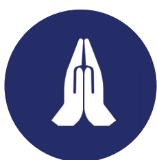
Partner By Praying

OTAN China Ministry Managers: All of our house church pastors have asked for leadership training for small group leaders. With the persecution that has occurred over the past few years, their churches have either been broken into many smaller groups or they are dividing themselves into small groups to avoid discovery. These smaller groups must have sound leadership. Please pray for boldness and safety as we travel around the country to train these new leaders.