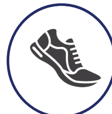
Partner By Going

Give securely online at otan.org . Help us reach China when you select "China Ministry" from the ministry menu.