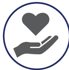
Partner By Giving

We're so grateful for our praying partners. Want to learn to more effectively pray for missionaries? Visit otan.org/pray .