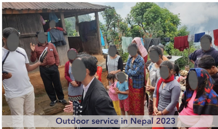
Outdoor service in Nepal 2023

OTAN has been serving in Nepal for more than 15 years, building connections with 30 churches. One pastor with a congregation of 60 members recently shared: