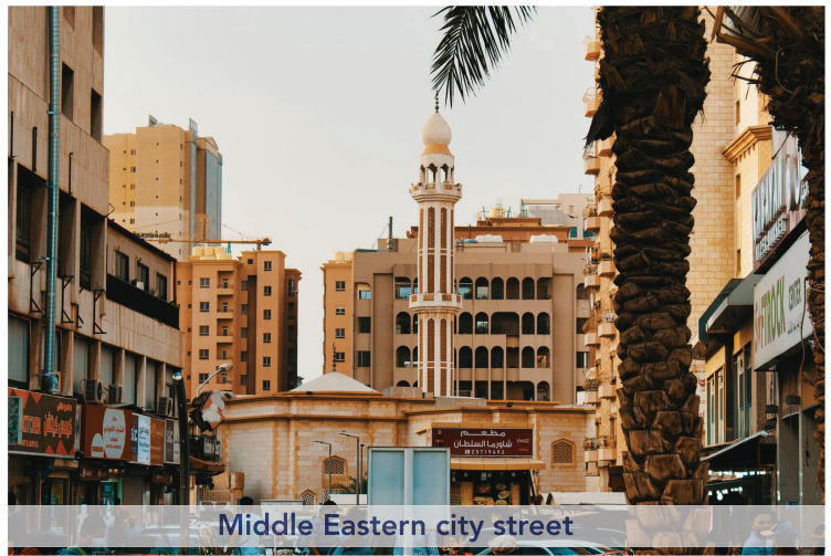
Middle Eastern city street

When we started the first Middle East training in 2018, an Egyptian believer became a source of encouragement and an essential part of our team. At the second conference, he invited Sudanese pastors and leaders, and the gospel spread through this ministry “exceedingly abundantly above all that we could ask or think.”