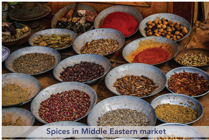
Spices in Middle Eastern market

Pray for the people who will be teaching. It can be very difficult to teach pastors and evangelists who are already in the field. Pray that the Lord will send the right people who will be motivated and willing to change their traditional ways of approaching the gospel.