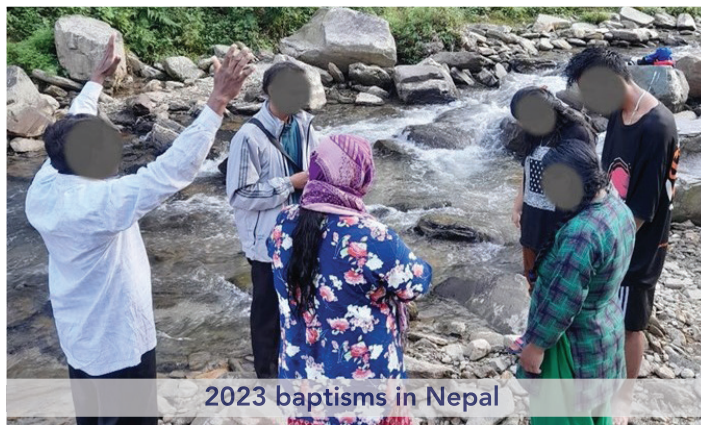
2023 baptisms in Nepal

"Thank you for your precious prayers and support!"