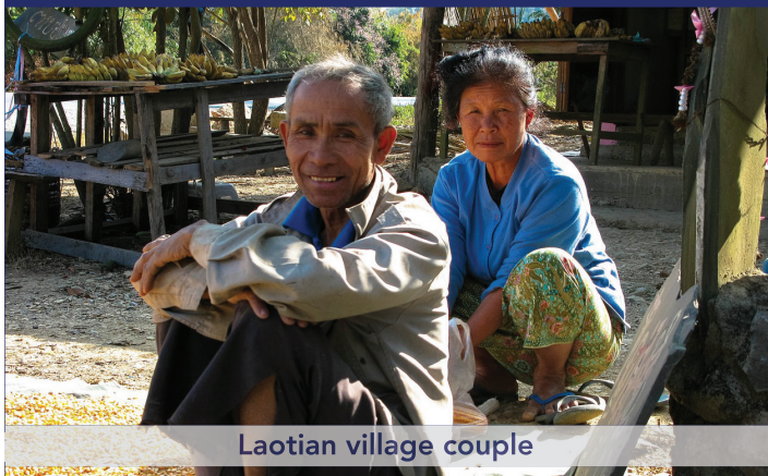
Laotian village couple

Recently, our Laotian pastors have asked us to host a marriage and family-based seminar that would include their wives. Traditional attitudes and gender role stereotyping have kept women and girls in a subordinate position, preventing them from equally accessing education and job opportunities. Also, there are few Christian marriage resources in tribal languages.